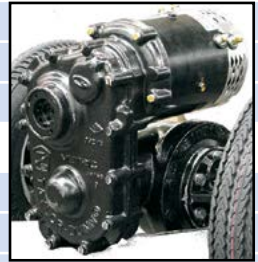
GT Automotive Drive