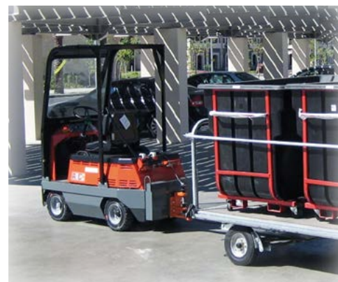
Note: Vehicles in photos show optional equipment.

The Huskey II AC combines high-powered towing in a compact maneuverable tow tractor, while providing optimal safety, comfort and ease of use.